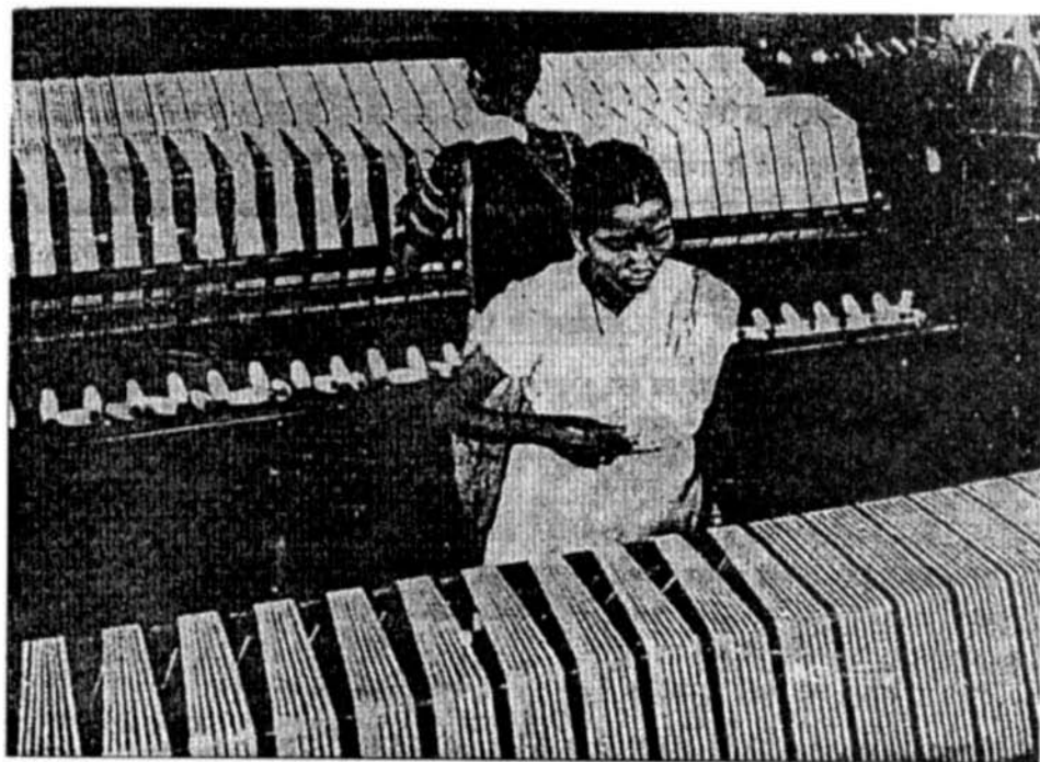
Fig.7 Workers managing a loom-machine in a mill Cloth was not made on the old hand-operated looms in these mills. They had many machines for spinning yarn and weaving cloth. These machines first ran on steam and then on electricity, just like the machines in the mills in Europe.