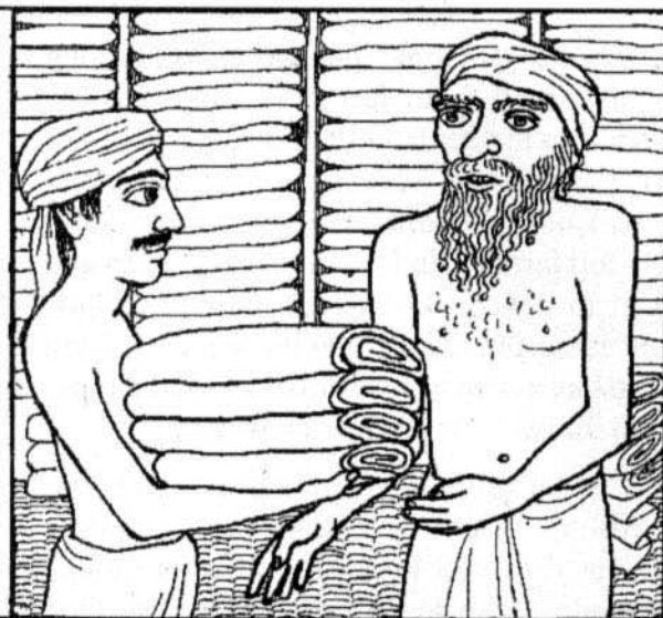
Fig. 4 Agent giving cloth to the trader

The trader's agent would go to the weavers and say, "Brother, I want so much cloth of this design. You take this money as an advance. With this you can buy the yarn and the other things you need. When the cloth is ready you sell it to us and to nobody else. Then we will give you the rest of the money."