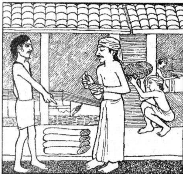
Fig. 3 Agent collecting cloth from the weavers