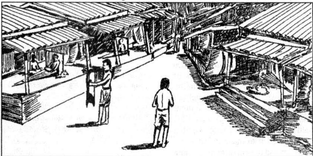
Fig. 2 A weavers' settlement

Another change that took place was that the weavers stopped making yarn at home. The demand for cloth was much greater than what they could produce. The whole family now preferred to concentrate only on the weaving of cloth.